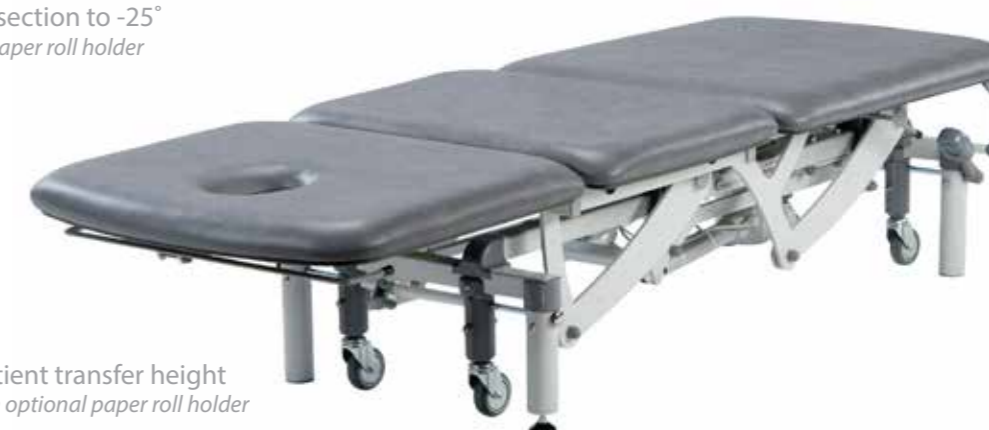
Low patient transfer height Shown with optional paper roll holder