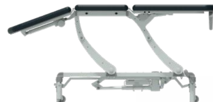
Negative head/foot section to -25° Shown with optional paper roll holder