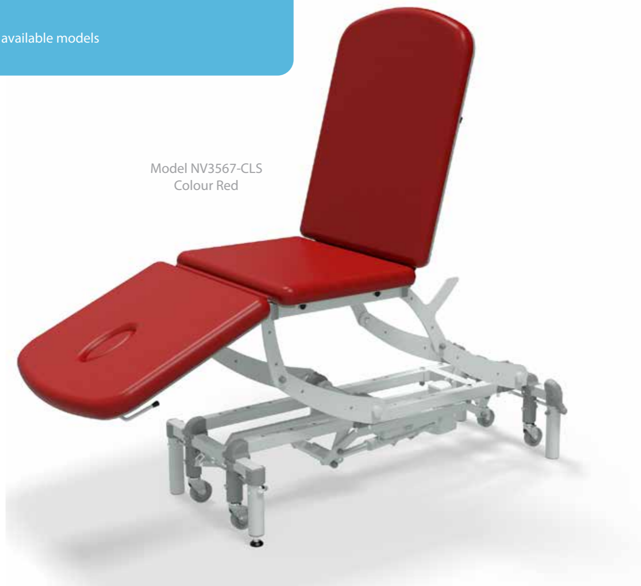
Model NV3567-CLS Colour Red