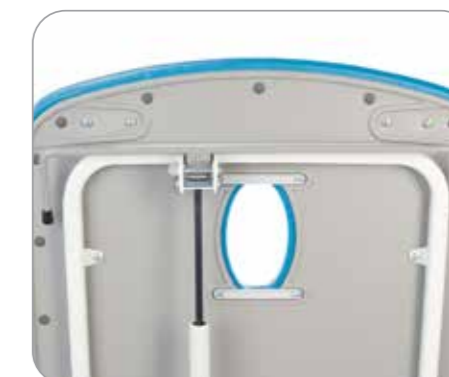
Offset gas strut for unobstructed patient view