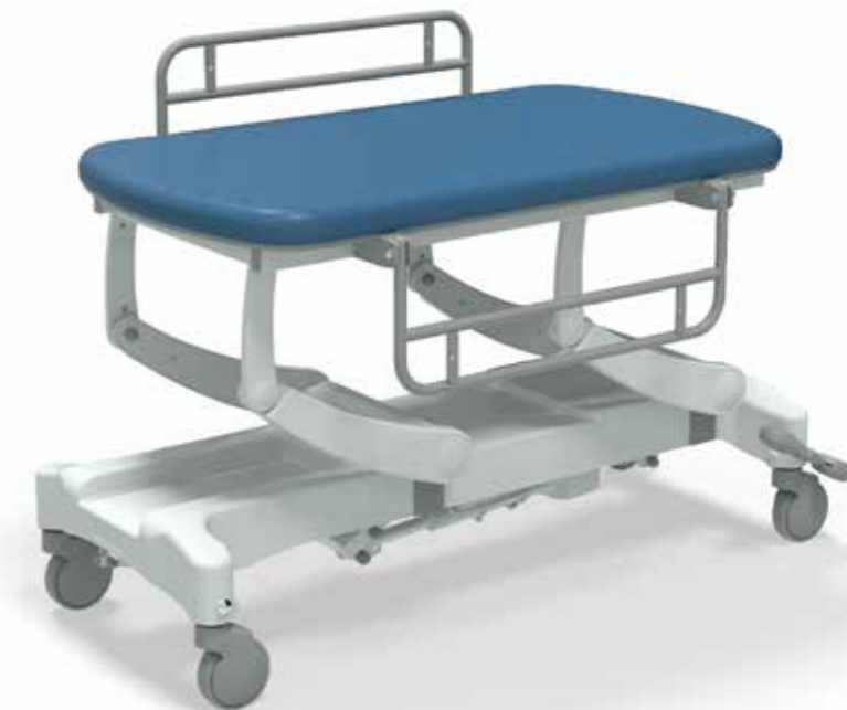
Model ST1661C-PRM (Small) Colour Sky Blue