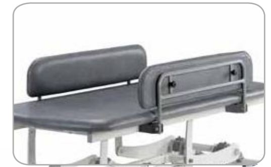
Optional 6002P Cushions for Side Support Rails