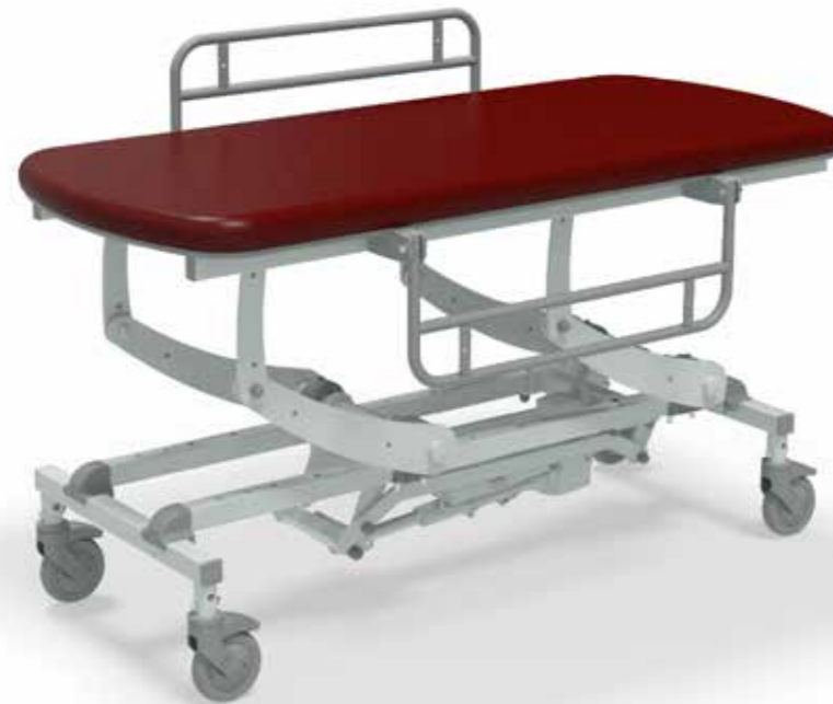
Model ST1461B-CLS (Medium) Colour Burgundy