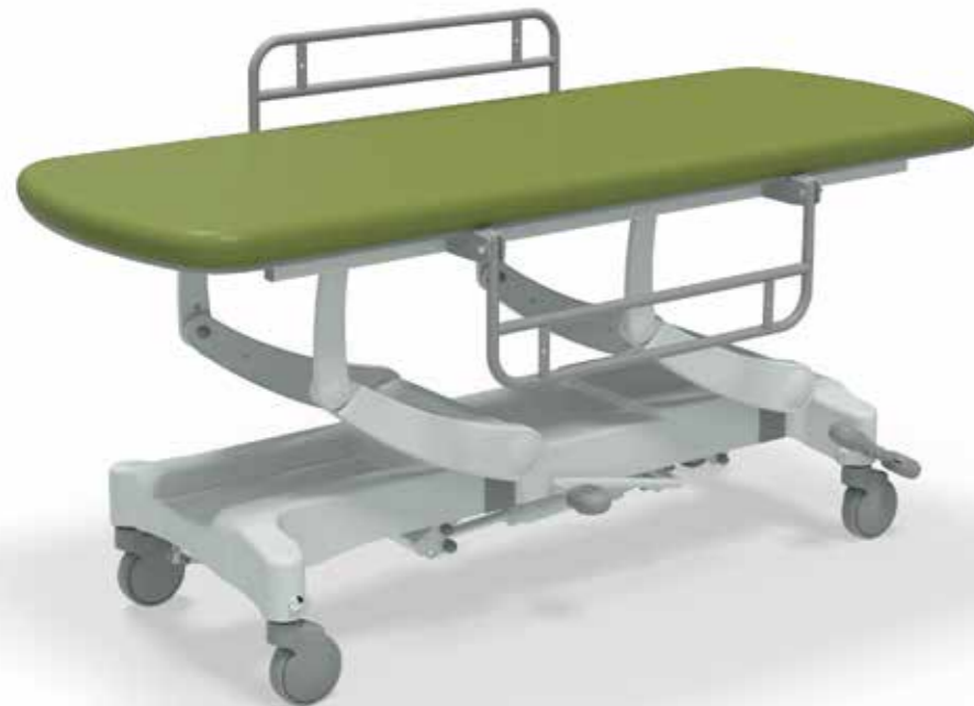
Model ST1651A-PRM (Large) Colour Olive