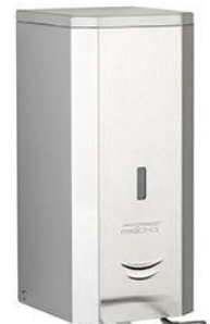
DJFP035CS Satin finish