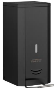
DJFP035B Matte black epoxy finish