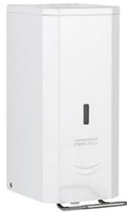
DJFP035 White epoxy finish