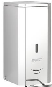
DJFP035C Bright finish