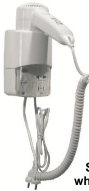
SC0030 white finish