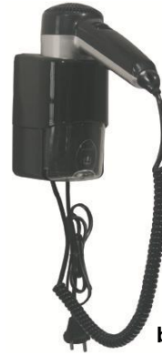
SC0030CS black finish