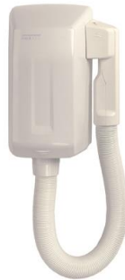
SC0004 white finish