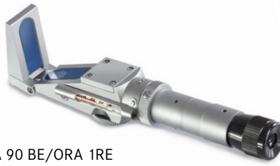
ORA 90 BE/ORA 1RE