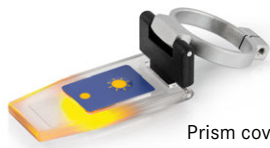
Prism coverplate with LED ORA-A1101