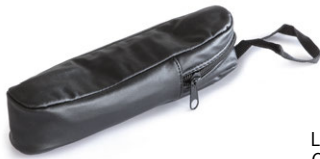
Leather bag ORA-A2103