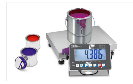
Durable stainless steel weighing plate