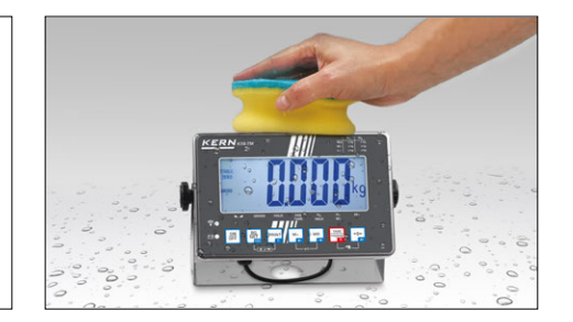
Stainless steel display device with IP68 protection, hygienic and easy to clean