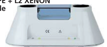
Table recharge station (with wall holder) recharge 2 "C" handles with Li-ion batteries.