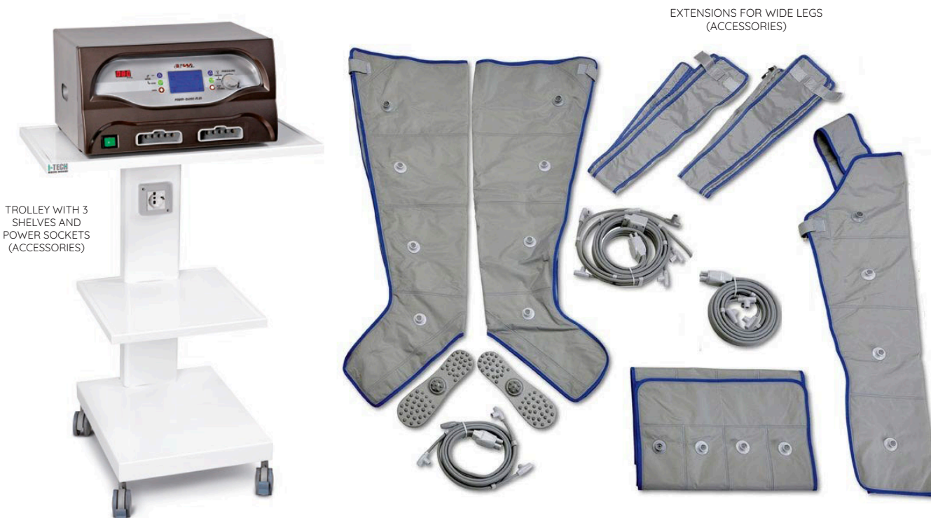
TROLLEY WITH 3 SHELVES AND POWER SOCKETS (ACCESSORIES)

POWER Q-6000 Plus offers 5 different inflation modes of the air chambers, 8 speed levels of the air flow inside the chambers and the ability to set the time and the pressure of the therapy. In this way it is possible to customize each treatment according to the therapeutic needs of each patient.