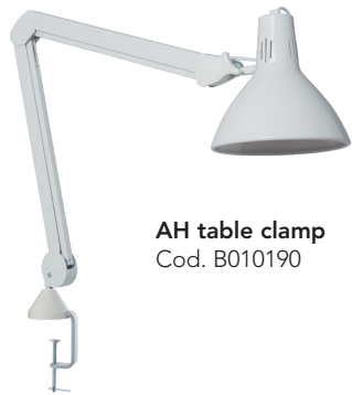
AH table clamp Cod. B010190