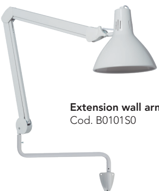
Extension wall arm Cod. B010150