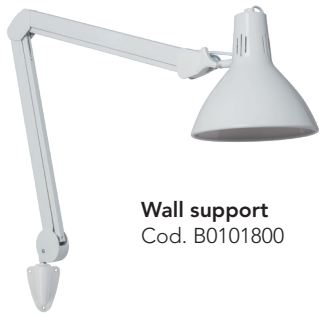
Wall support Cod. B0101800