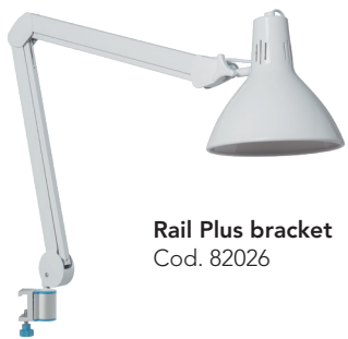
Rail Plus bracket Cod. 82026